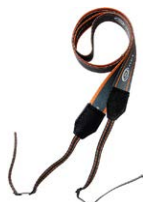
meter strap (type M-1)