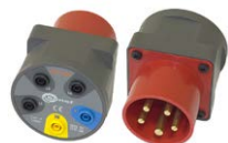
AGT-32P three-phase socket adapter 32 A WAADAAGT32P