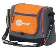
M-6 carrying case