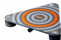
PRS-1 resistance test probe WASONPRS1GB