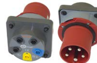
AGT-63P three-phase socket adapter 63 A WAADAAGT63P