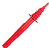
test probe with banana socket; 1 kV; red