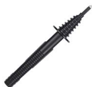
test probe with banana socket; 1 kV; black