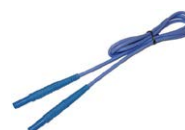
test lead with banana plugs; 1 kV; 1.2 m; blue