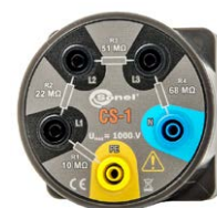
CS-1 cable simulator WAADACS1